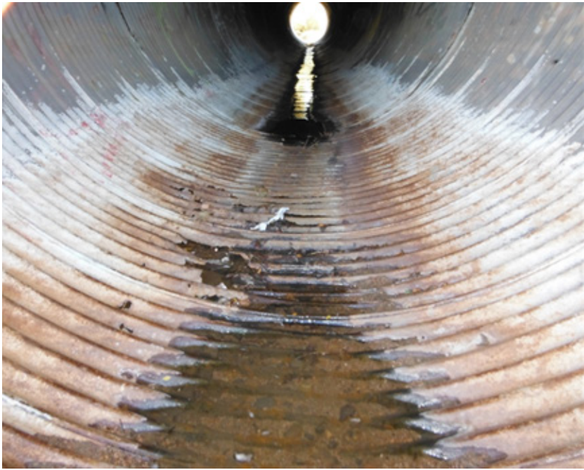
Aurora CMP, Aurora, Colorado - Before