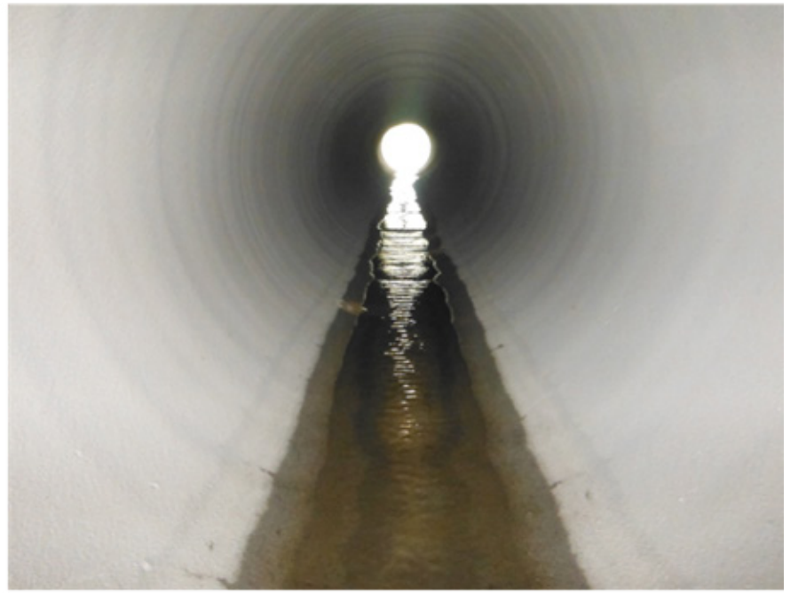
Aurora CMP, Aurora, Colorado - After